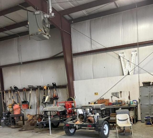
BLDG 510 Sewer Maint Shop