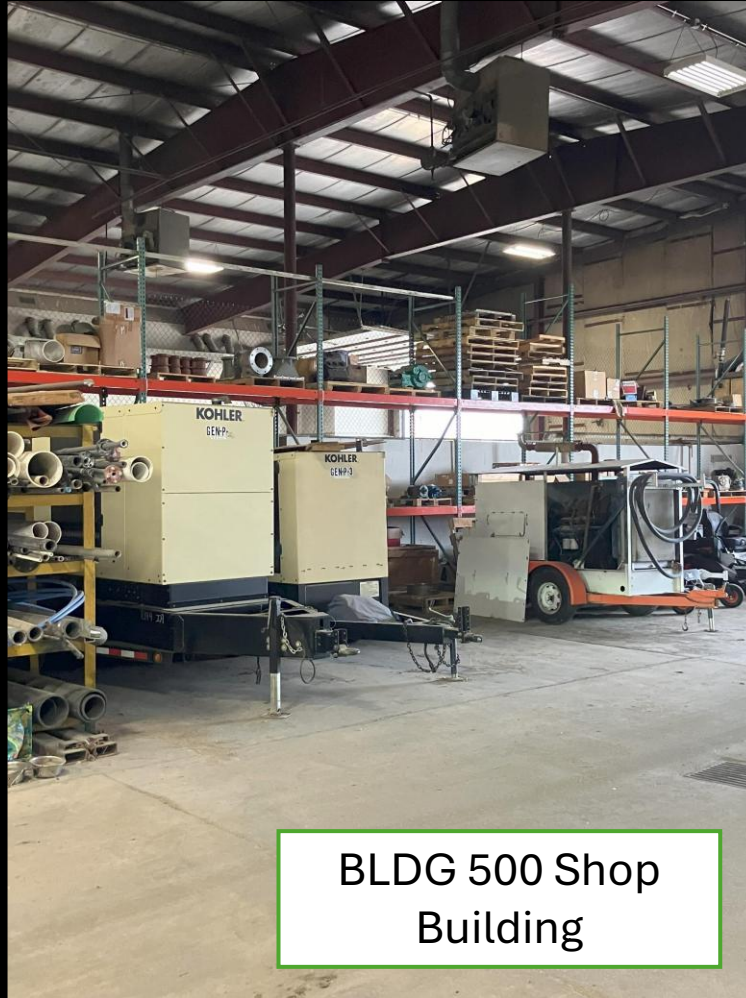
BLDG 500 Shop Building