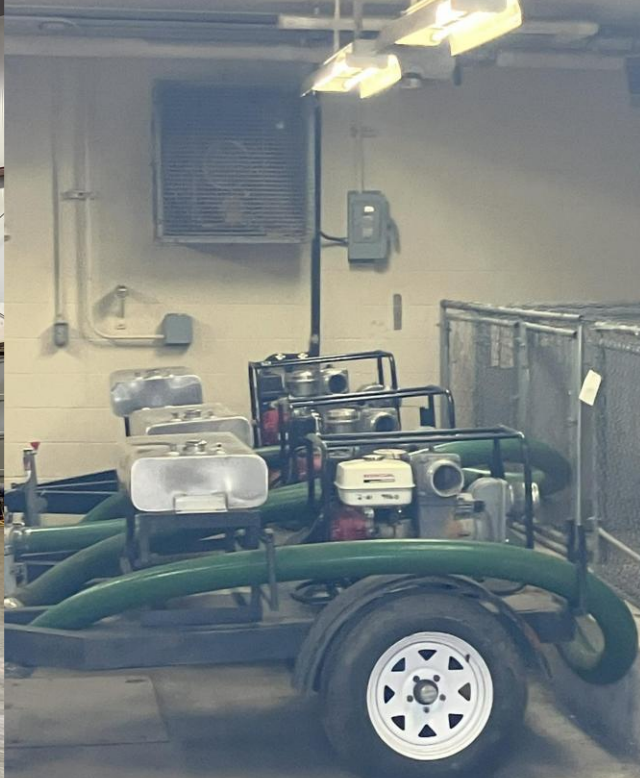
BLDG 800 Old Main Lift Station