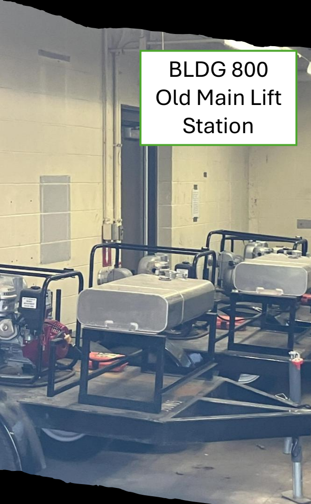
BLDG 800 Old Main Lift Station