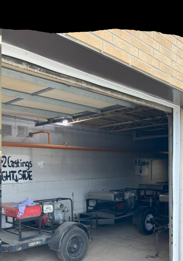
BLDG 330 Dewatering Garage