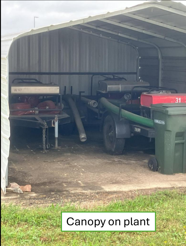
Canopy on plant