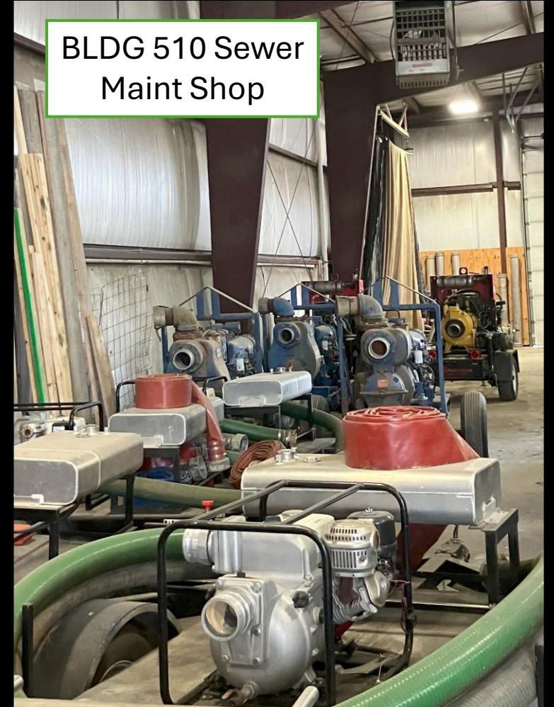
BLDG 510 Sewer Maint Shop